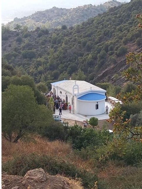
St Sozon church held a blessing on September 7 th in Asprogia. The church is in a valley and overlooks the Kannaviou Dam